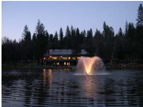
ECCO at night

Come up one evening for a good night's sleep, awake to breakfast, and enjoy your meeting with a healthy lunch. Grab some free time in the afternoon. Relax, enjoy and depart refreshed.