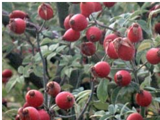
Rose hips adorn a section of the Self-Interpretive Nature Trail

Views change with the seasons along the Nature Trail