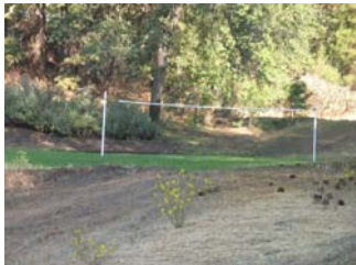
The grass volleyball court