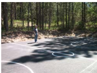
Half-court basketball is available on the 4th Green complex