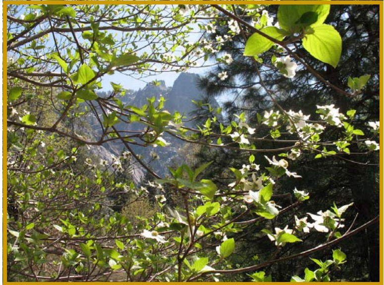
Yosemite in Springtime—Dogwoods in Bloom

ECCO provides the meals and the space. You provide the project. Enjoy the companionship of others as you work on your labor of love. Informal workshops may be offered as we get volunteers. Please let us know your area of interest (and your area of expertise if you'd be willing to lead a session).